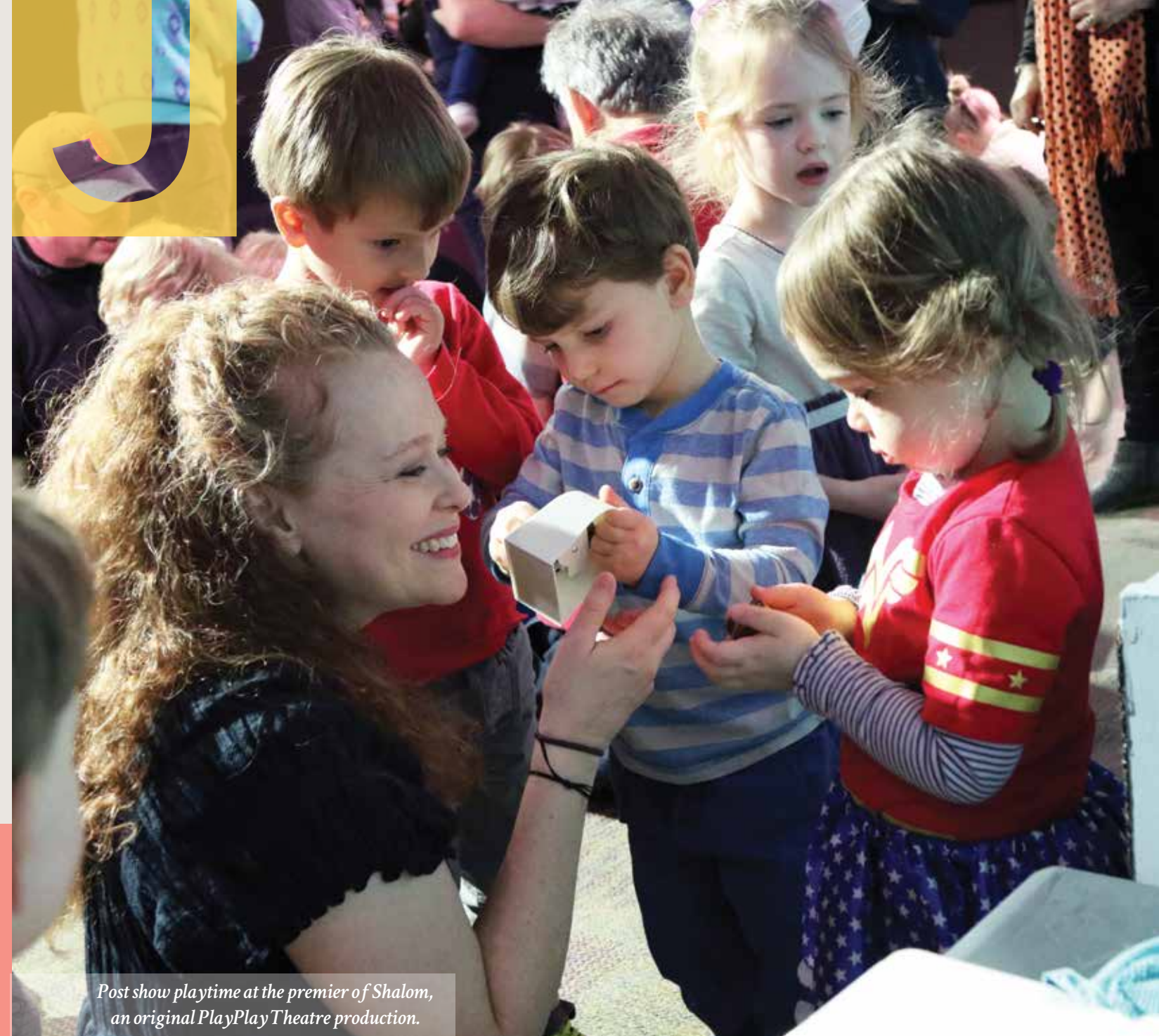
Post show playtime at the premier of Shalom , an original PlayPlay Theatre production.